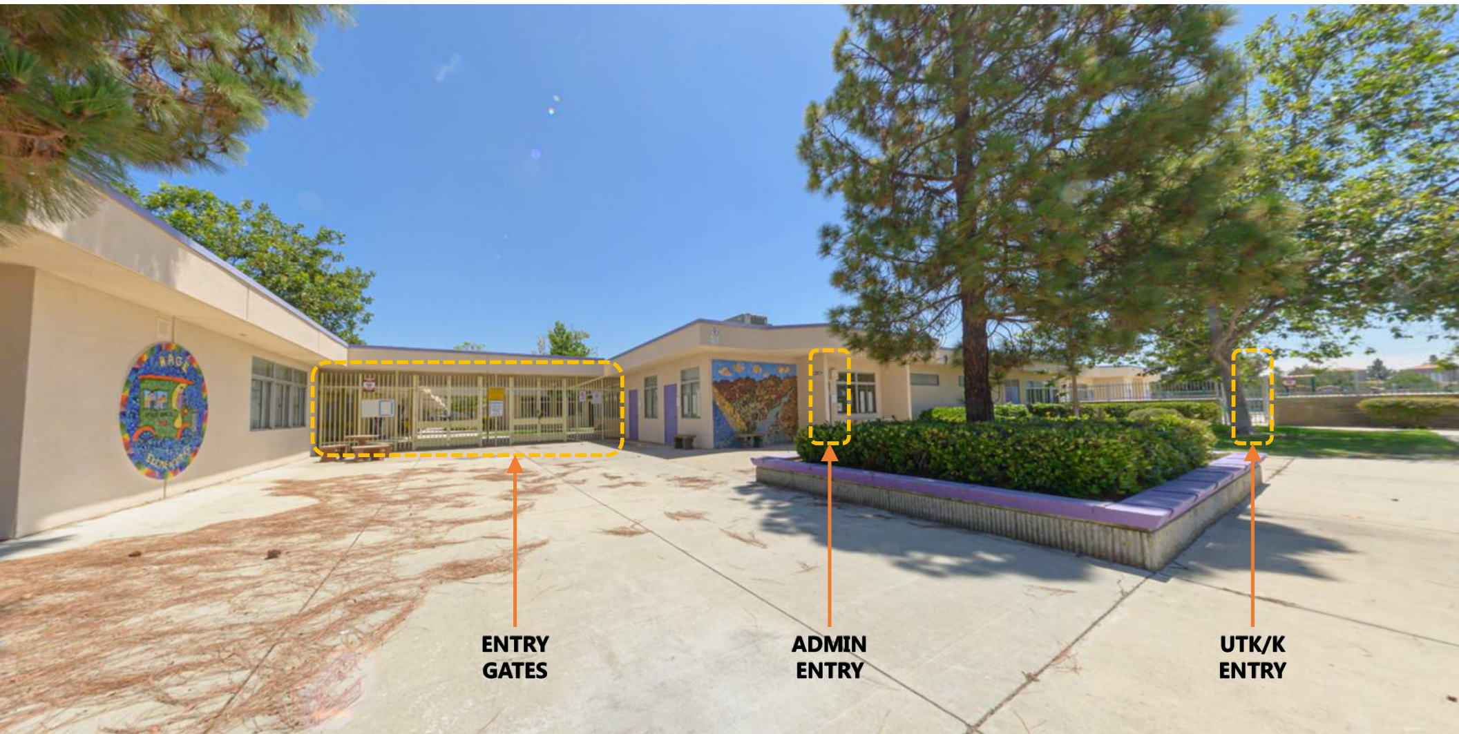
Review of campus and Admin access