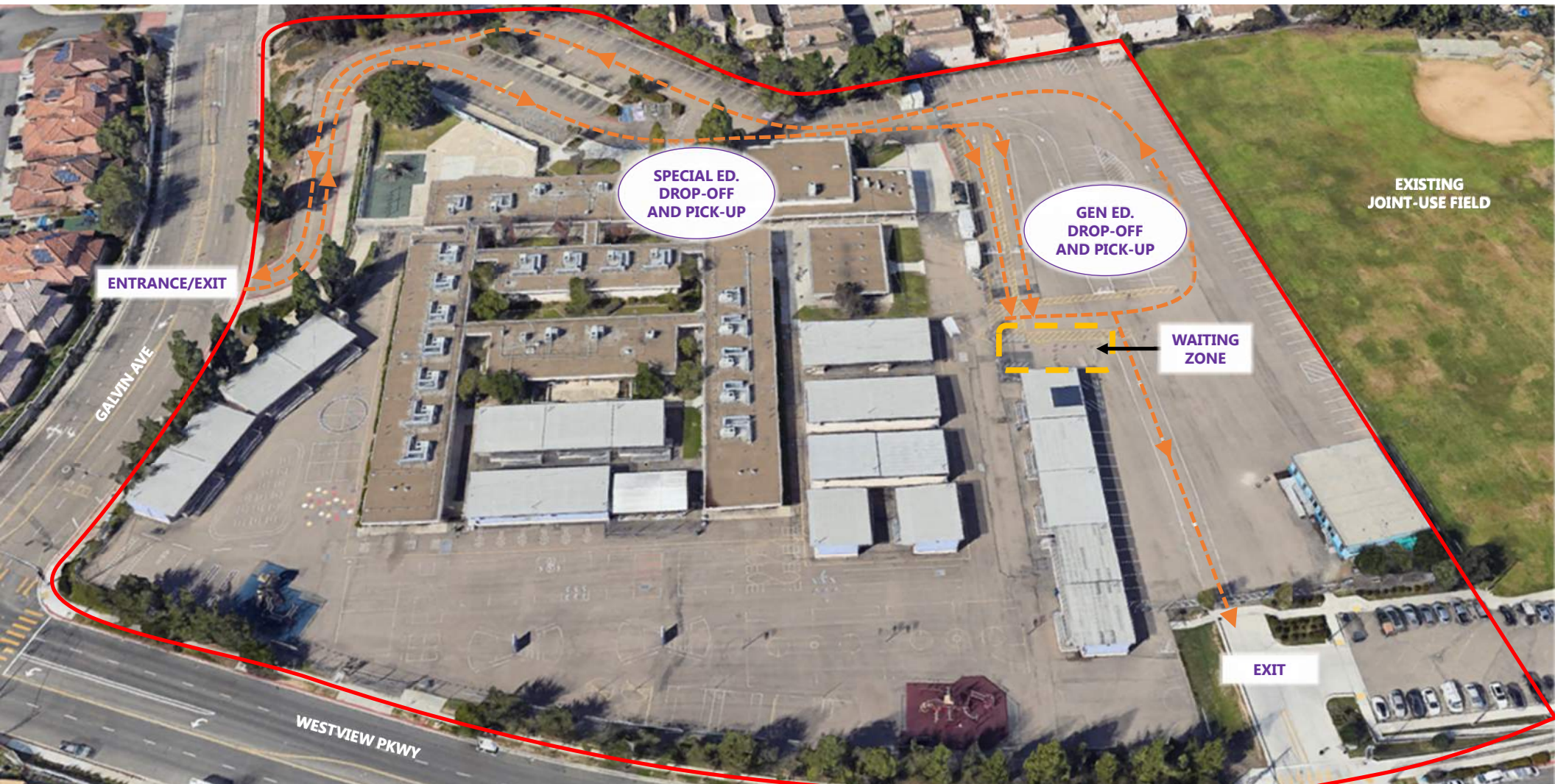
Review existing drop-off/pick-up